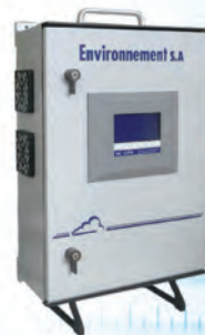
AC32M tight box version