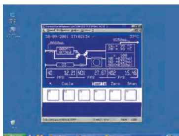
CONTACT remote control software