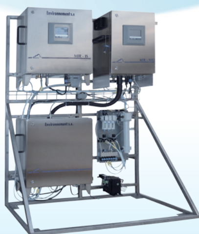
Turnkey system "on frame" including MIR 9000H